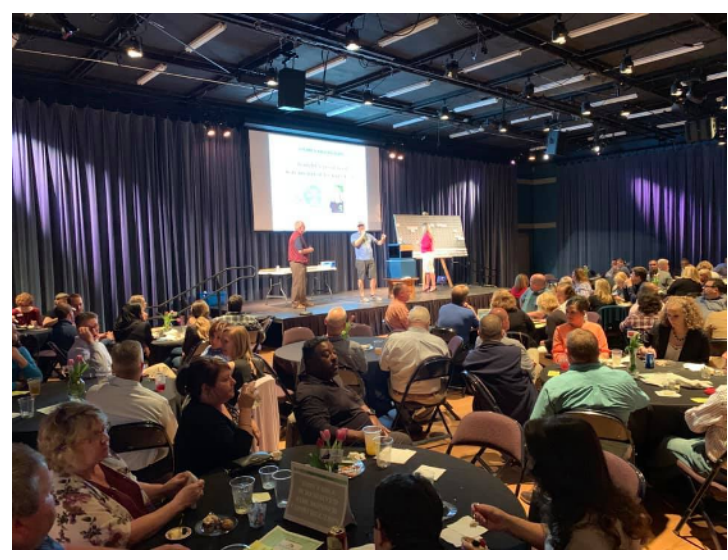
HBACV faces challenge of safe distancing at this event, crowd shown here from 2018

The committee reviewed both the event logistics and options available under the current pandemic rules allowed in Virginia under Phase III (goes into effect in July).